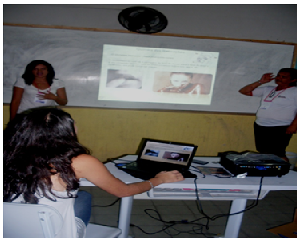
Figure 5. Seminar presentation of the students from 3 o A showing changes of emotional sensations dare to drug abuse.