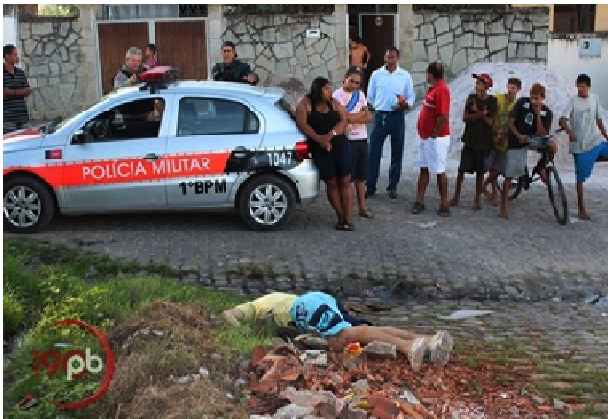
Figure 1. Murder of a young caused (reckoning by drugs) for a debt of drugs in the city of João Pessoa Mandacaru district in the state of Paraíba [8].

of homicide, drug occurred in August 2012 in the city of João Pessoa in the neighborhood Mandacaru in Paraíba state.