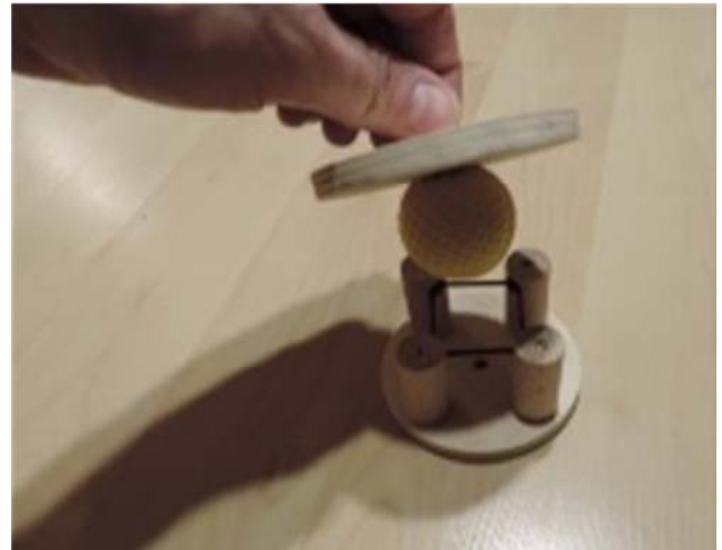
Figure 5. Bolt hook in a rawl plug – the screw causes the plastic rawl plug to expand radially outwards.

But when is a rawl plug used nowadays? This is always the case when a screw cannot be screwed directly into an object (for example, a wall). In such a case, a cylindrical hole is first drilled in the object, a rawl plug is inserted and the screw then screwed in.