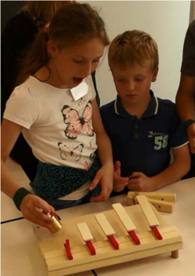
Figure 4. Self-built wooden clip.

In the context of the clip, an exploration of springs is also conceivable; for example, the children can build a coil spring from wire themselves and load it with weights. It can then be observed how much load the springs will withstand and consider how this relates to the diameter of the coil spring and the thickness of the wire.