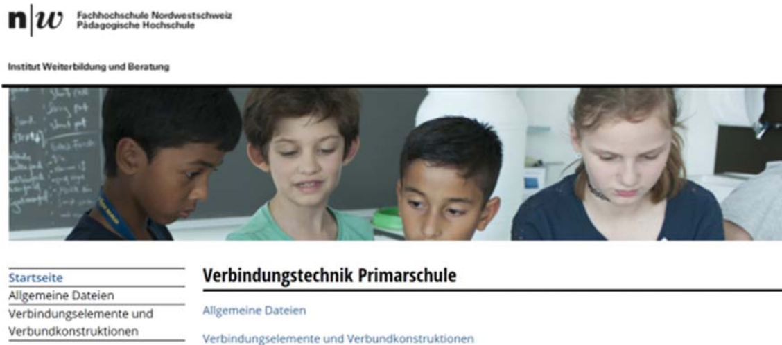
Figure 1. Screenshot of the online platform homepage.

The teaching ideas and materials that were developed and reworked are now available online as modules ( https://web.fhnw.ch/ph/projekte/verbindungstechnik-primarschule/verbindungstechnik-primarschule ).