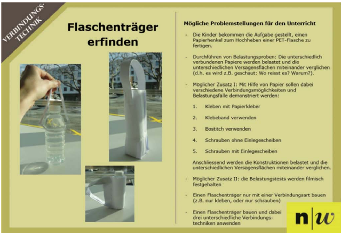
Figure 2. Teaching ideas for the module Building a bottle carrier.