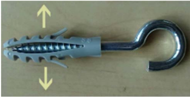
Figure 6. Model of a snap fastener.

In the classroom, the buttons can be treated in a variety of ways. For example, the pupils can collect buttons in everyday life or take photographs of buttons. The buttons can then be sorted, categorised and discussed. It is also possible to build a model of a snap fastener with the pupils (Figure 6) and to compare this with a real snap fastener. By way of follow-up, the children can make a fabric wristband fastened with a snap fastener they have attached themselves. It is also possible to visit a button collection or a tailor's shop.