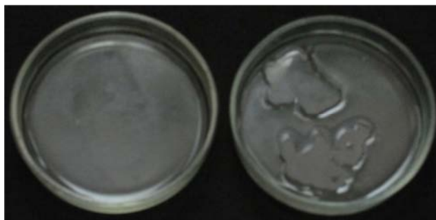
Figure 2. Left: 5 ml of water with an electric potential of -200 mV cover all the bottom of a Petri dish. Right: 5 ml of water with an electric potential of +200 mV do not cover the bottom of a Petri dish; the surface of such water decreases rapidly after mixing.

(Apparently, this distinction should be defined more precisely. The forces acting between molecules that reside on the surface of positively charged water are stronger than the forces acting between molecules that reside on the surface of negatively charged water. On the other hand, the interaction between the negatively charged molecules of water and the surface of the glass are stronger than the same interaction between the positively charged water and glass surface.)