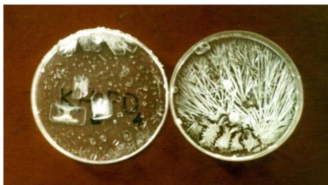
Figure 1. This is the crystals of KH_2PO_4 . Left: the rhombic crystals formed upon drying of an aqueous solution of KH_2PO_4 prepared on the water with positive electric potential. Right: the needle-shaped crystals formed upon drying of an aqueous solution of KH_2PO_4 prepared on the water with negative electric potential [5].

In our previous study, we used the water with a different electric potential [5]. When conducting these experiments, we drew attention to the fact that the surface tension of water depends on its electrical potential. This relationship was the fact that the surface tension of water with a positive potential greater than the surface tension of water with negative