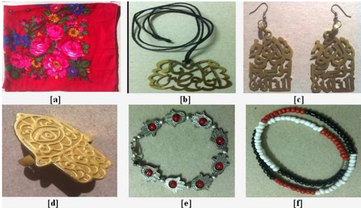
Fig [15] Different accessories wear by protesters in Egyptian revolution Alpha