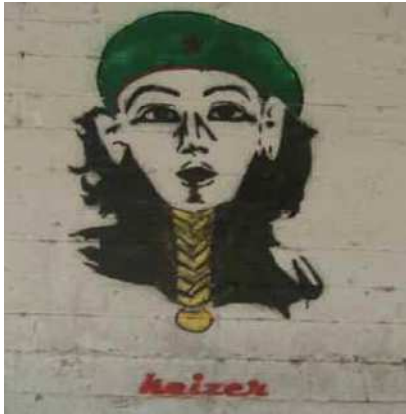
Fig [2 b] Pharaoh Guevara, Keizer, Gezireh, Zamalek, photo: Maya Gowaily. (9)

Figure [3-a] Akhenaten first attempted to impose uniformity in the Egyptian religions in the era of the Pharaohs and how is Palace Worship the one God is Aton as religion revolution.