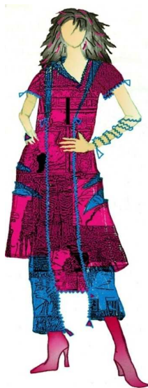
Figure (20-b) inspired structural design (fashion design)

The design elements include women Egyptian ancient from fig. [8] and Egyptian tank man from fig. [14]. The tank man is in the center of the design to make balance and the women cut design reflect the real video from revolution when man stop front tank and women scream: "brave". The filter made harmony between women and tank man to complete each other. The gradation white colour to black colour give feeling depth of history from the first look to the design.