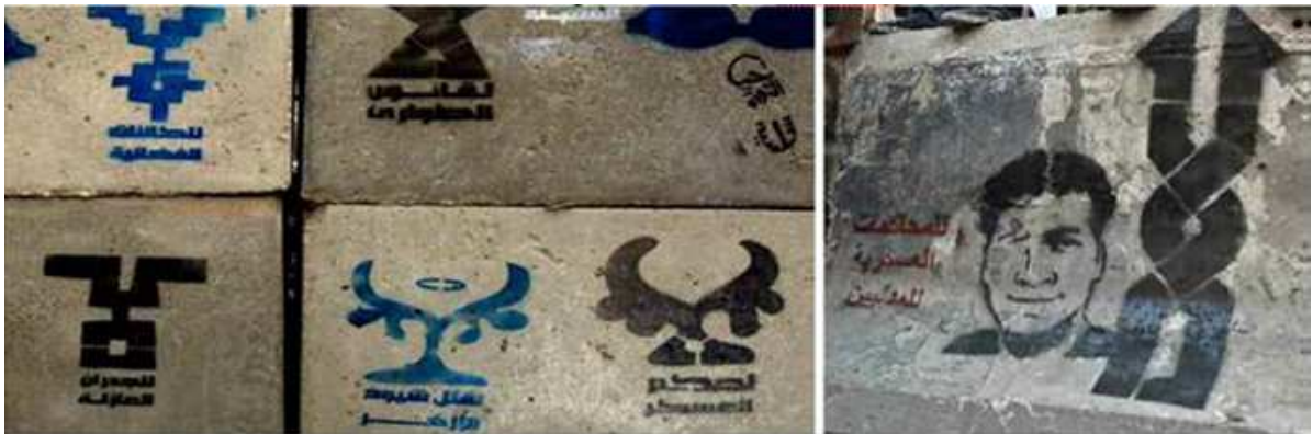
Fig [7] No Extra-Terrestrials. No Emergency Law. Long Live the Revolution. Non-Violent. No Separation Walls. No Killing Azhar Sheikhs. No Military Trials for Civilians. Fahmi St., Downtown, photo: Maya Gowaily and Omar Kamel.(9)