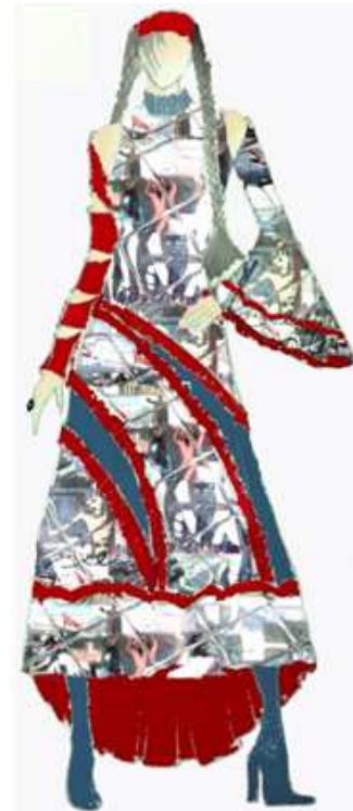
Figure (17-b) inspired structural design (fashion design)

In this design merge fig.[12-b] and fig. [13] as symbol inequity in past that led his Qasr al-Nil bridge crossing to the future. The filter used to imagine the past from Egyptian ancient it for the present and future. But, Egyptian flag appear in the back to national confirm. And, appear Arabic line in design right (down).