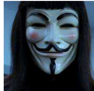
Fig [4-a] Guy Fawkes mask from V for Vendetta film.

Figure [4-b], show young Pharaoh Tut Ankh Amen with famous cover wear V for Vendetta mask. Zeft Egyptian artist draw Guy Fawkes mask to reflect anarchists in Egypt by corporation with Tut Ankh Amen Mask. Alpha