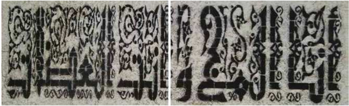
Fig [6] I'm the Brains and You're the Brawn by Arab Kofi line, Mohamed Mahmoud St., Downtown, photo: Maya Gowaily.(9)