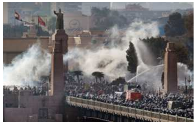
Fig [13] Scene of the 2011 revolution; image from Getty Images / Peter Macdiarmid.(3)

Figure [13] saw Bridge Kasr El-Nil confrontations pedicle between peaceful protesters and the Central Security Forces on January 28 in what is known collecting anger and that played a major role in the overthrow of the Egyptian regime where launched teams Central Security tear gas at the protesters and sprayed water on them, vehicles have also Central Security to kill them and had ended by confrontations protesters to enter Tahrir Square. Statue of Saad Zaghloul, in front of the Egyptian Opera House was witness on what happened in this battle. Modern history will remember this battle, "the battle of Qasr al-Nil Bridge". This time was not a battle against the Zionists and the British, but was with the new occupier soldiers perched on our chests. We fought with our money. And the weapons of our children from the same people.(12)