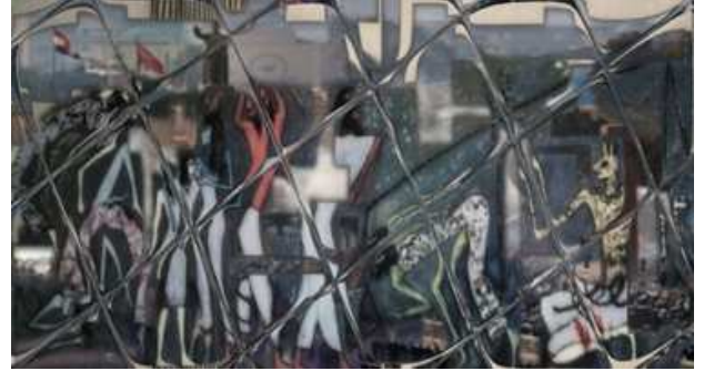
Figure (17-a) inspired decorative design (textile printing design)

columns and capital. The garment may be divided into many parts, to give us feeling eye restful between decorative parts and solid parts. Curve lines in design make movement and activity to express about revolution with horizontal lines. Usage gradation colours from white to black for give design eldest.