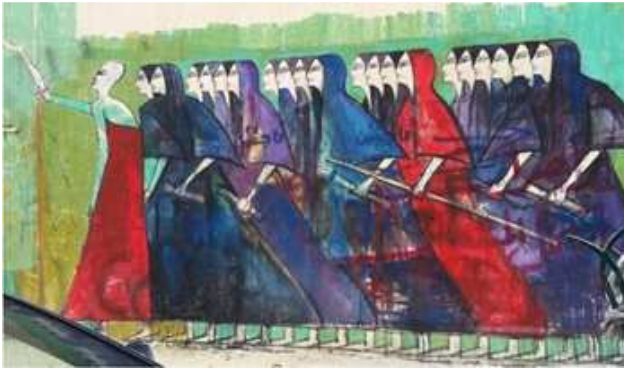
Fig [10] Mohamed Mahmoud Mural, Alaa Awad, Mohamed Mahmoud St., Downtown.(9)