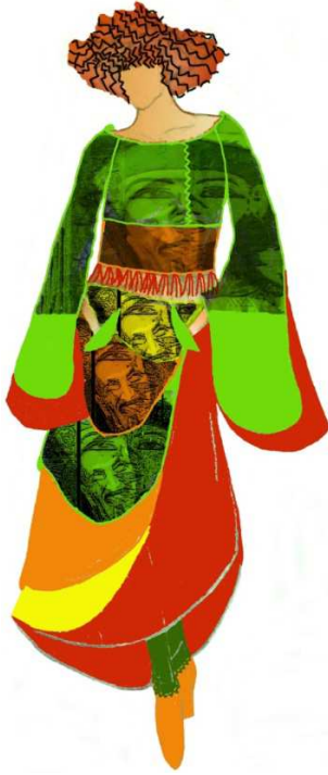
Figure (21-b) inspired structural design (fashion design)

The design contain blouse and layers skirt. The upper part shows an interaction between decorative designs but in the lower part. Different sizes of faces interacted together vertically in layers skirt to give a sense of the complete view and the life scenery. From this gradation the faces in decorative design from upper to lower part in structure design to make smooth sequence and usage hot colours from yellow, orange, red, green by the same style.