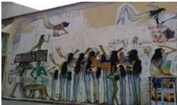
Fig [8] Mohamed Mahmoud Mural, Alaa Awad, Mohamed Mahmoud St., Downtown, photo: Maya Gowaily.(9)

Figure [8] shows Mural inspired from famous Egyptian ancient reflect the woman act in Egyptian revolution. The artist draw brave women walk to back in funeral as symbol to funerals that killed in Egyptian revolution.