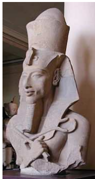
Fig [3-a] Akhenaten.

Figure [3-b] Sheikh Emad Effat cited in the events of the Council of Ministers on Friday, December 16, 2011 after being shot. He said: "The air Tahrir Square is the best for myself from Air Kaaba".(9) Revolution artist draw Sheikh Emad Effat in Akhenaten picture because the both made revolution in religion concepts from point of protesters view.