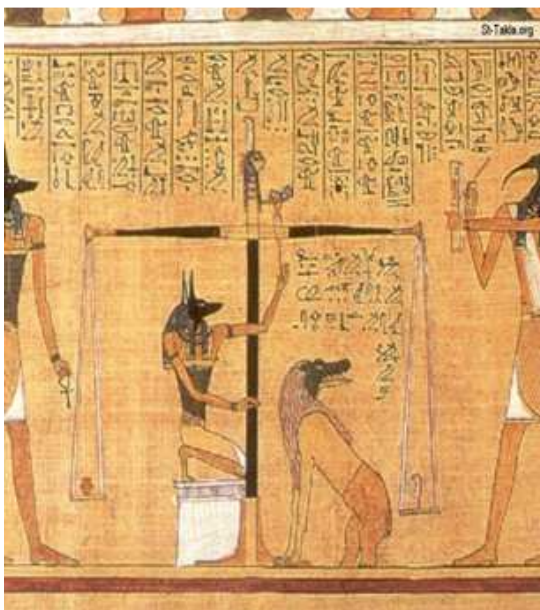
Fig [12-a] Panel Account Anubis God of the dead