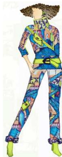
Figure (19-b) inspired structural design (fashion design)

Pharaoh, obelisk, pyramid, temple wall, Arabic lines from fig.[7], women on stairs in fig. [9], and group of women in fig. [10], gathered in this design in trial to create a type of harmony among the different monuments that has sharp edges and bended and diagonal lines. The repetition the different types of Arabic lines refer to the welling to make balance with other component. The bright colours of the design reflect the dynamic atmosphere that suitable to women's customs.