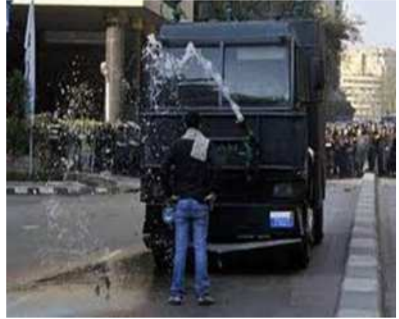
Fig [14] Egyptian tank man .(13)

Figure [15] shows different accessories usage to express on revolution. Figure [15-a] rural scarf was called by revolutionaries to express his revolution identity. Figure [15-b,c,d] reflect Arabic lines with folk art in copper accessories from necklace, earring, and ring. Figure [15-e,f] show bracelet and necklace used sliver and beads by national colours (red- white- black)