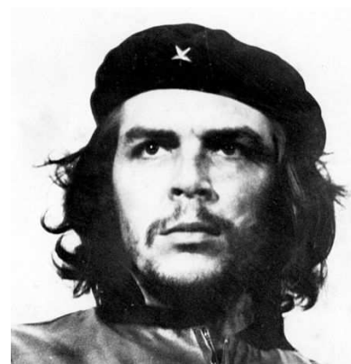
Fig [2 a] Ernesto "Che" Guevara. (10)

Figure [2-b] shows recreated Guevara picture inspired directly from the Egyptian Pharaoh Tut Ankh Amen with Keizer artist. Keizer needs mixing between Guevara as a symbol of revolution for world youth and Egyptian symbol young pharaoh Tut Ankh Amen to reflect influence the Egyptian youth by Egyptian ancient history and related by revolutions history.