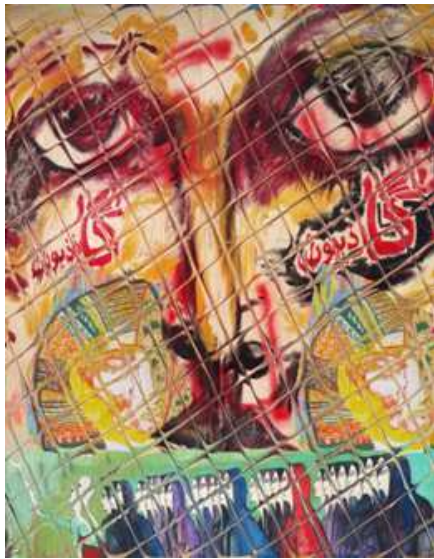
Figure (18-a) inspired decorative design (textile printing design)

shoes, and cover head give feeling completeness.