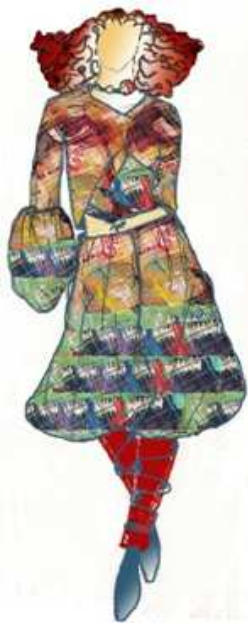
Figure (18-b) inspired structural design (fashion design)

The design basically consists of complete face with its eyes along with ancient Egyptian women in lower part from fig. [5] and fig. [8]. The space between eyes to mouse contains Arabic line (kazabon) and girl Egyptian ancient. The filter made the sense of a type of motion by net from right and left diagonal lines. This distribution of elements with pure and hot colours gives gradation in all design and gives the sense of history and refers to the richness of component.