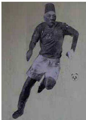
Fig (1) The Revolution Scored a Goal! (Saad Zaghloul, independence leader of 1919 revolution wearing star footballer Abou Treika's jersey.) Sad Panda El Marghani, Heliopolis(9)

Egyptian revolution is more than a simple mania for Egyptian protesters. It is not enough to copy famous Egyptian nation forms– real artists must “re- create” them in the cauldron of their own sensibility and in the context of their times, or must give them an appearance of renewed vitality, a function other than the purpose for which they were originally intended as shown as in figure [1], The Revolution Scored a Goal! (Saad Zaghloul, independence leader of 1919 revolution wearing star footballer AboTreika's jersey).(9)