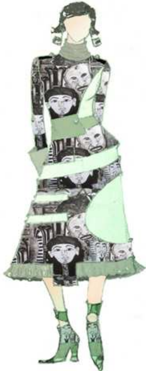
Figure (16-b) inspired structural design (fashion design)

In this design the decorative units used fig. [2-b, 3-b, 4-b] alternate between the faces copied and adapted from ancient Egyptian and columns and capital, jars, head of pharaoh, and ruinous of old temple in trial to recreate these elements together in novel usage of decorative units. Repetition of the head of pharaoh refers to the continuity and longevity for revolution symbol.