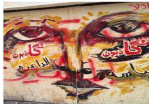
Fig [5] The Martyr First Liars Prostitution Politics, Mohamed Mahmoud St., Downtown, photo: Maya Gowaily.(9)

Figure [5] shown young Egyptian artist draw eyes from Egyptian ancient to give us feeling live eyes as symbol truth front to liars politics. And, write by Arabic language liars (kazaboen) with army caps. He draw close mouse reflect silence with liars.