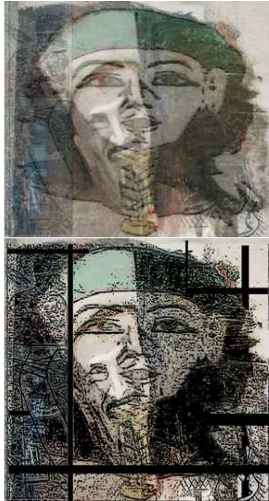
Figure (21-a) inspired decorative design (textile printing design)

The dress shows an interaction between decorative design and structure design. The tank man controlled on fuchsia area in dress and women take turquoise area in it. The zipper connects between parts, make good proportion to decorative design to work well together and move eyes up and down in all design.