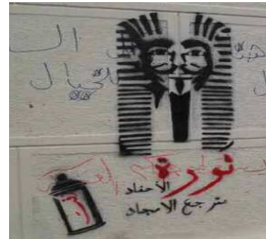
Fig [4-b] Our Descendants' Revolution will Bring Back Our Former Glory, Zeft, The Cabinet, photo: Maya Gowaily.(9)

Figure [5] shown young Egyptian artist draw eyes from Egyptian ancient to give us feeling live eyes as symbol truth front to liars politics. And, write by Arabic language liars (kazaboen) with army caps. He draw close mouse reflect silence with liars.