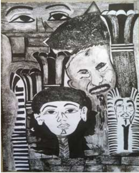
Figure (16-a) inspired decorative design (textile printing design)

In this design the decorative units used fig. [2-b, 3-b, 4-b] alternate between the faces copied and adapted from ancient Egyptian and columns and capital, jars, head of pharaoh, and ruinous of old temple in trial to recreate these elements together in novel usage of decorative units. Repetition of the head of pharaoh refers to the continuity and longevity for revolution symbol.