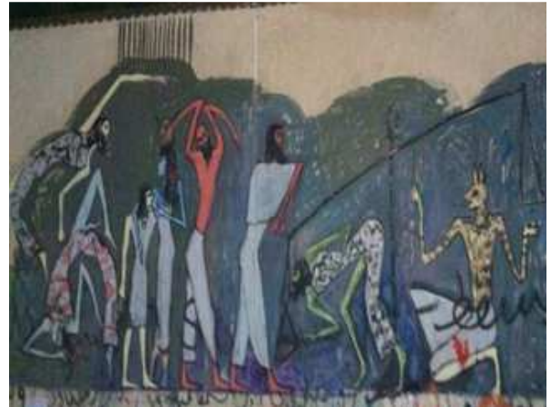
Fig [12-b] Mural from AUC wall in Tahrir Square reflect the unfair trial and unbalance of justice.

Figure [12-a] shows Panel Account Anubis God of the dead from Egyptian ancient.