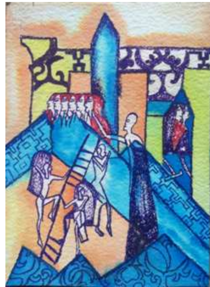
Figure (19-a) inspired decorative design (textile printing design)

decorative design repeated in wide part in sleeve and trousers to give feeling of dominance the women in revolution. The colours grade from yellow, red, and blue to give consistent steps.