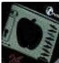
Figure 3. The screen of the lie detector mentioned in the main text. Apple means “true “.

investigators and they can , observing same Youtube videos , by more professional devices , confirm our findings