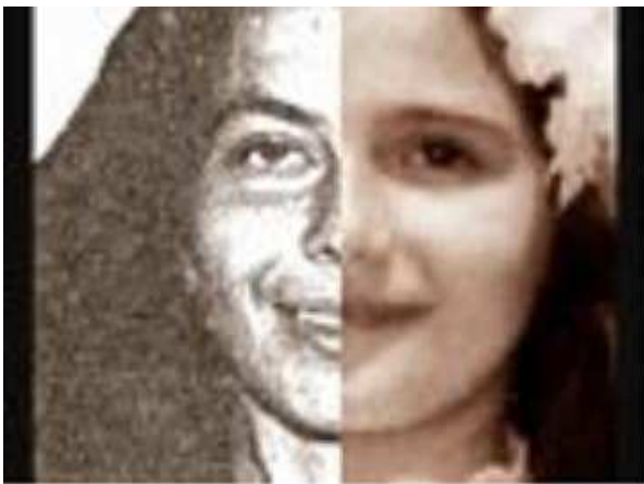
Figure 2. Photo composition from a job by an Italian criminologist. The right part of the face of the girl disappeared many years ago and the left part of the face of a lady who could be the girl.

We are always assuming the previous example. Mrs. Y may have a FB profile with her photos, of course we can compare the lady's face with the X girl's one using photos posted on old newspapers or on Internet. If we use a software like GIMP or other photo processing software [14] [15] which are freely downloadable, we can do complex analysis of the photos too. For example, we can combine the right part of the face of X with the left of the face of Y in one image. The following is an example of this technique. Image was taken from a research on Google and has been obtained by famous criminologist Francesco Bruno, in 2008 using a software which today is freely available