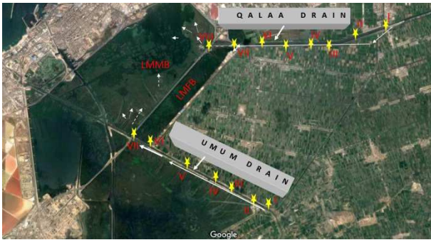
Figure 1. The sampling stations in the Two studied drains, (Qalaa and Umum Drains).

the soluble Mn +2 was considered to represent the overall reduced form of Mn under anoxic conditions. In the current study the suggested Mn solubility in Qalaa Drain is due to the anoxic condition of this Drain which reduced the Mn +4 or Mn +3 to more soluble Mn +2 . El-Rayis et al., (1984) [11], pointed out that, water-bearing H 2 S is able to solubilize P-Mn of high oxidant states Mn +4 and/or Mn +3 by reducing them to the reduced and more soluble form of Mn +2 . This could be the reason for the noticeable the high concentration of D-Mn.