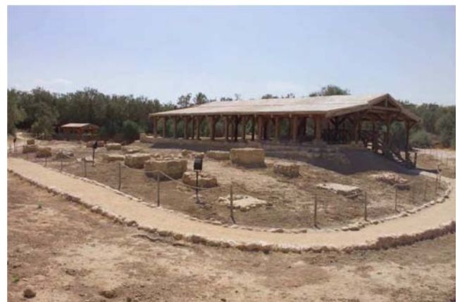
Figure 8. Site development included foot trails, shelters, signage system....etc.

Recognition of the heritage site points to the Jordan's astuteness in advancing the issue. There is huge tourism potential in the millions of Christians who could be interested in being baptized in the Jordan River at the same place as Jesus. Currently more than 100,000 pilgrims visit the site but