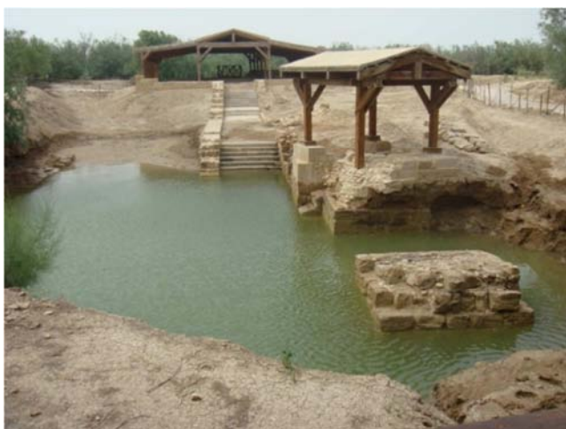
Figure 6. The small church, the steps and the monastery on the eastern bank of Jordan River (Waheeb: 2012).

Traveler Arculf, who visited the region in the year 670 AD supports the idea that a church existed near the eastern bank of the river. Before quoting Arculf, one should point out that there is more than one script for Arculf's trip to the holy lands and some of them are not sound. Arculf said "that the wooden cross is located in the place where Jesus Christ was baptized on the other side another script said it was located at