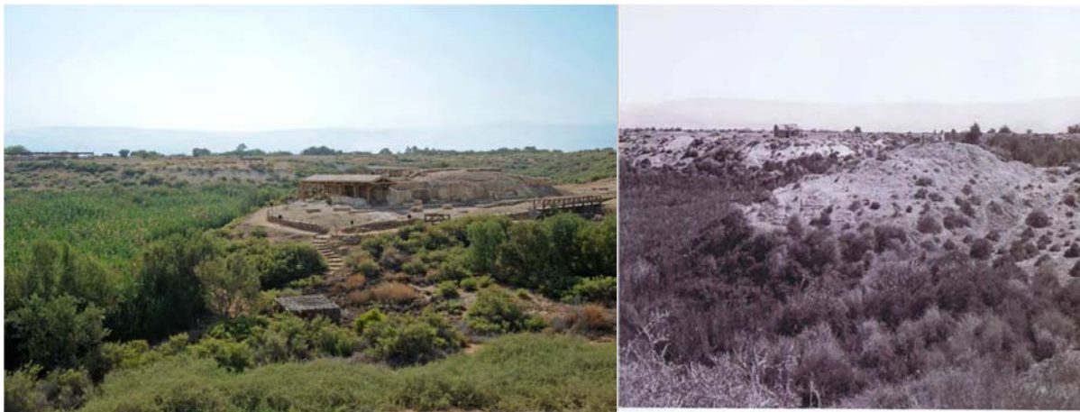
Figure 5. Photo of Elijah's Hill A- before excavations/ B-after excavations.

"We approached this place, where Jesus Christ was baptized and the passage of the believers and from the same place Elijah was ascended to the heavens. On that bank of the river, there is the fountain near which John the Baptist used to baptize (it might be the fountain shown on Madaba's mosaic map, especially that its date coincides with that of the visit of Antony the Martyr). The destination from there to the river is estimated at less than two kilometers, and on its two banks lives the monks. We celebrate epiphany near the river, where one could see miracles that night where Jesus Christ was baptized. There is a hill surrounded with protection wall and at the point where the water flows back to the valley there is a wooden cross fixed in the water and at the river's banks there are marble steps which take people to the water. Above the river, not far from where Jesus Christ baptized, John the Baptist's monastery. It is a big building and is comprised of two storeys.