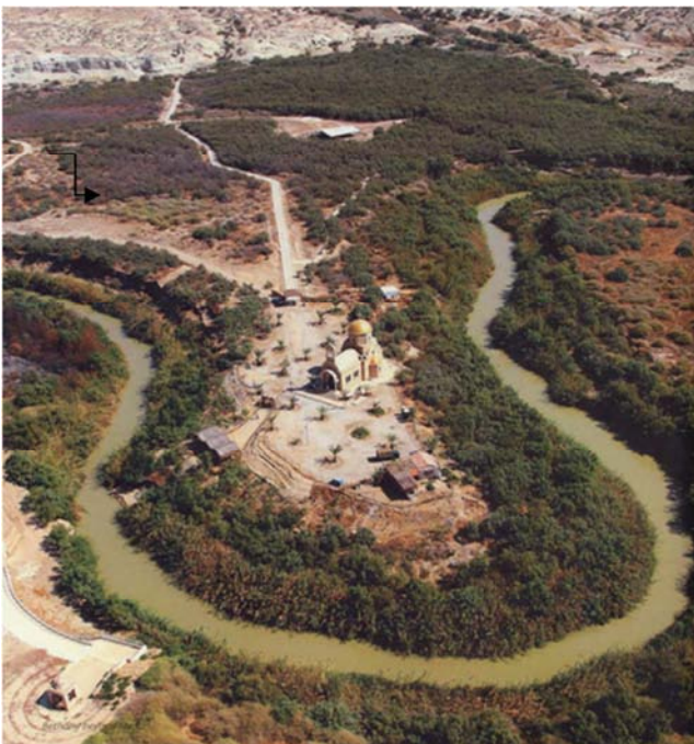
Figure 7. The recovered monastery on the eastern bank of Jordan River.

As an important religious site, several Christian Churches desire to have their presence in places of veneration and accordingly locations just outside the property have been and continue to be allocated for the construction of churches. Although these recent structures could be seen as compromising the authenticity of the setting of the site, they do not presently impinge on or negatively impact the central area containing the archaeological remains. [17]