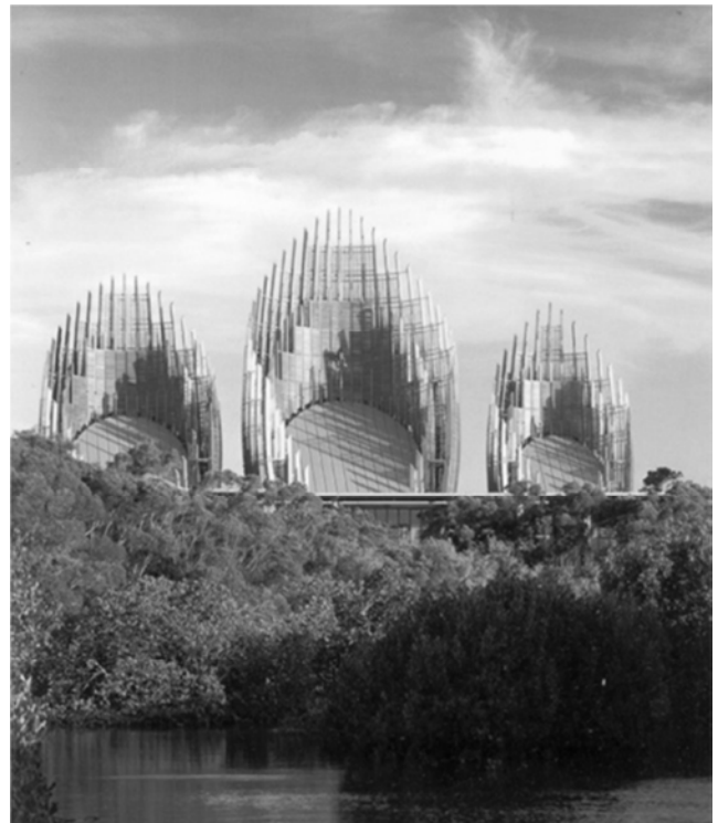
Figure 4. Tjibaou Cultural Centre.

adjusted freely according to the direction of wind and the intensity of wind strength. In terms of energy conservation, it can make full use of air circulation to reduce the heat radiation of the sun in the tropics.