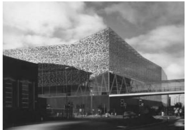
Figure 2. John Lewis Department Store and Cineplex.

The John Lewis Department Store and Cineplex designed by FOA uses a "net curtain" as the skin to cover the surface, which looks like a fabric and reflects the local handicraft culture. The skin pattern originated from the translucent sari woven by Indians living in Leicester and the fabric produced by JOHN LEWIS. These patterns are rich in decoration and arouse people's traditional culture related to their memory [13]. The form of the skin not only reflects the development of modern materials and techniques, but also conveys the regional traditional culture it contains.