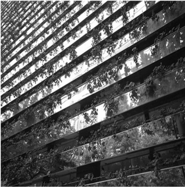
Figure 3. Z58.

surrounding environment, creating a way to read and transmit the urban landscape [9].