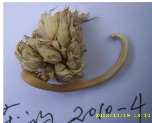
Figure 3. Mutagenic and hybrid-occurring spiral-distorted wheat ear.

There must be a variety of aberrations in the progeny of the spiral disc curl of wheat spike. These aberrant plants and combinations with them are like the kaleidoscope that opens the mutation. Among them are high stems, middle stems, and short stems. There are also large grain wheat plants. In 2014, the maximum 1000-grain weight was 73.0 g, 77.0 g, 80.0 g and 84.8 g, respectively. Materials with a maximum 1000-grain weight of 84.8 grams were obtained