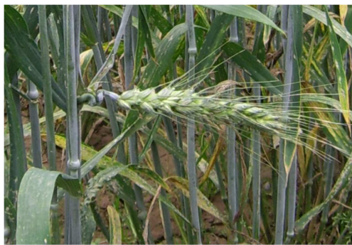
Figure 1. 90° curved aberrant plants in 09-3.

The natural mutant material 2003B was treated for 5 times, and the character of large grain appeared in 2008, and in 2009, the character of large grain was obvious, that is, No. 09-3 (Figure 1). 09-3 × Lovrin, F1 showed super strong heterosis with grain length of 8mm and 1000-grain weight of 80g. After F2, traits were segregated. In 09-3, the mutant plant of wheat panicle torsion 90 degrees was found (see Figure 1). [12] The next generation of this material is used as the mother of hybridization, and Mian yang 36 is used as the father of hybridization. The F1 shows a strong advantage, calling it 2010-4. Among them, the performance of 2010-11 is also outstanding. In their own offspring, there are helical malformed mutant plants in the ear of wheat (Figure 3).