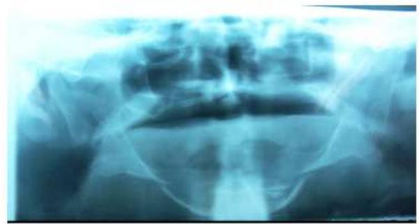
Figure 3. A panoramic radiograph showing progressive resorption & tapering of the mandible with bilateral body fractures at 6m after receiving the treatment.