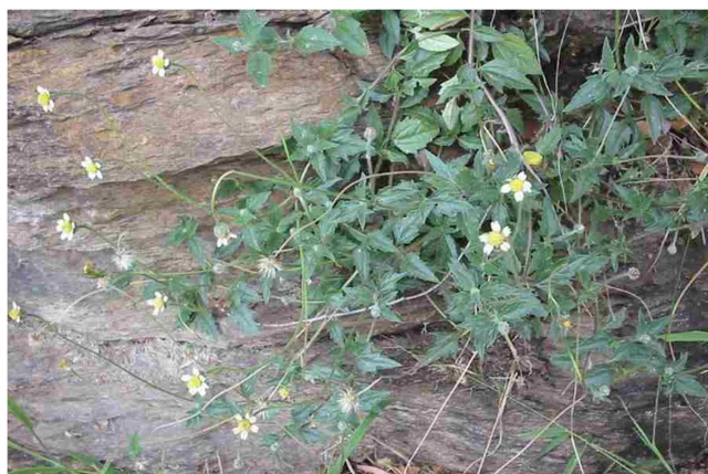
Figure 1. Tridax Procumbens Plant.

Tridax procumbens plants were collected from a site somewhere around A. T. B. U. Bauchi, Yelwa Campus as can be seen in Figure 1 below, followed by the separation of stems from leaves and flowers. They were thoroughly washed, cleaned, divided into pieces and then placed into muffle furnace at a temperature of 440°C for 120 minutes using the evaporating dish in the Chemistry laboratory, Federal Polytechnic Bauchi. After it has been dried off completely, 25% by volume of concentrated Sulphuric Acid was added and again kept in the furnace for 30 minutes at the same temperature of 440°C as described by [19]. The product obtained is known as activated carbon prepared from Tridax procumbens stem.