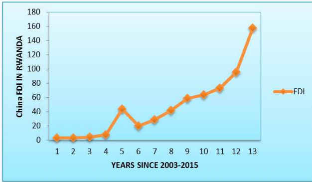
Figure 3. China FDI's to Rwanda (Source: Ministry of commerce of the People's Republic of China and National Bureau of statistics of China. Statistics bulletin 2015).

expenditure of the multinational. The basic infrastructure constructions are necessary for attracting the investment.