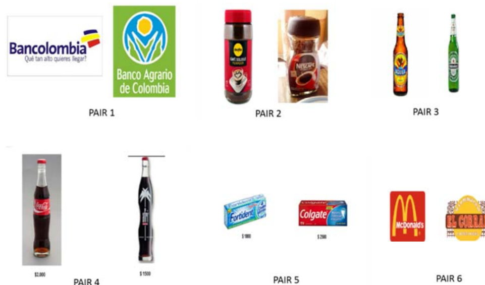
Figure 1. Consolidated slides presented to participants.

Data from 21 healthy subjects, skilled (10 women and 11 men) were collected. Aged between 18 and 53 years ( m = 27 ; SD = 9.9 ). They were invited to participate in this pilot study previously reported, and paying them a value of $ 20 for two hours for their time. All were in good health at the time of enrollment and had normal psychiatric and neurological examination. Exclusion criteria were any active or history of a major psychiatric disorder (manic depression, schizophrenia, Alzheimer's disease poorly controlled); any disease that may affect current or past brain function; drug or alcohol abuse; and any history of head trauma, brain surgery, skull defect, stroke or transient ischemic attack or stroke in previous MRIs.