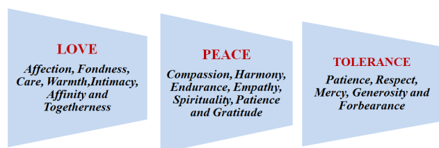
Figure 1. Illustrating the universal Rumi's teaching indicators for promoting global Love, Peace and Tolerance.

To stimulate love, tolerance, peace and harmony Rumi, stressed to promote knowledge, education and dialogue (Figure 1).