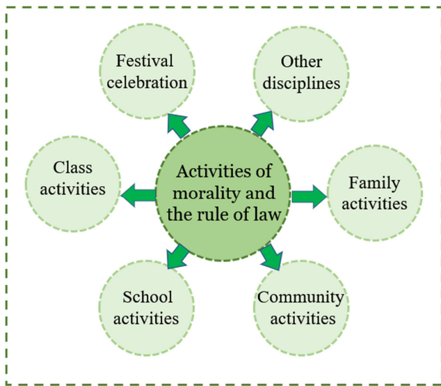
Figure 2. The activities of morality and rule of law lessons can be combined with other activities.

educational activities is essential for improving the effectiveness of the curriculum. The activities of morality and rule of law lessons should be combined with other activities that students involved in, as shown in Figure 2.