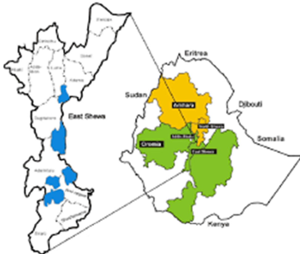
Figure 1. Map of East Shewa Zone.

selected using systematic sampling technique. From the selected PAs, sample households were randomly selected for data collection. A multi-disciplinary team was established to conduct the survey using different PRA tools. Different PRA tools like direct interview, focus group discussions and personal observations were employed to collect information on different aspects of existing crop production systems of the study area. Focus group discussion and key informant interview were employed to get about the existing crop production system, prevailing constraints, with key informants (farmers, Development agents, and community leaders) in the study areas. Finally, 184 sample households were selected for primary data collection.