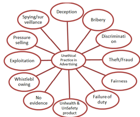
Figure 1. Elements of Unethical Practices in Advertising.

Unethical advertising will often distort or misrepresent it's product as well as seek secretive means of cajoling or influencing its target audience.