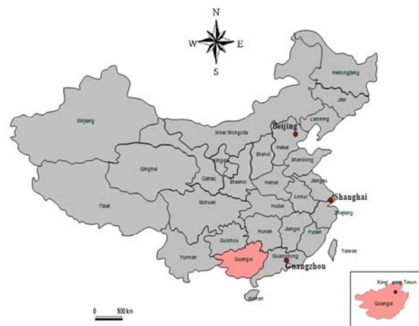
Figure 1. Location of Xing'ping town in map of China.

Traditional commercial street layout in Xing'ping Town consisted of the Old Street, New Street and Hunan Street with total length over 700 meters. Landing on the Gudu quay, there is the entrance of Old Street. With commercial development in Ming and Qing Dynasties, the Middle Street which now is one stretch of the New Street extended out at the ending of Old Street. It continued rolling out and formed today's complete New Street. Hunan Street grew up later when business men from Hunan Province moved in and their decedents settled down in Xing'ping after 1840 AD. Three streets finally connect with each other and become the complete traditional commercial streets in Xing'ping Town. Figure 2 shows the traditional commercial streets in Xing'ping Town.