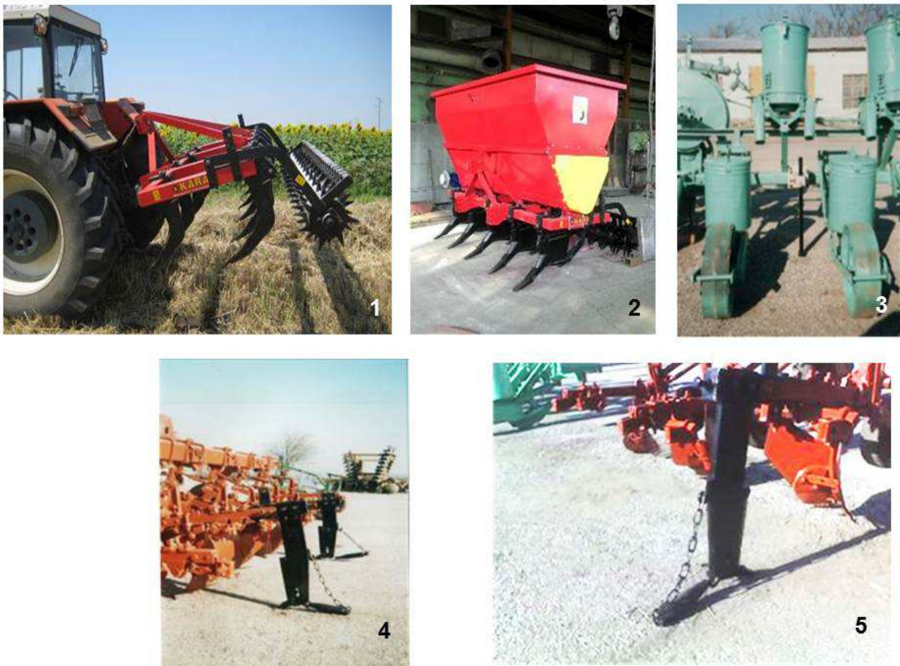
Figure 1. Machines and devices for the implementation of the advanced soil protection technology for minimum and unconventional soil tillage: 1- chisel cultivator CP-9; 2- specialized machine for vertical mulching; 3- sowing machine SPC 6 with slitting device; 4 - cultivator KRN 4.2 with cutting work bodies; 5 - A combination grooming device for implementation slits with ducts attached on cultivator KRN 4.2.

The economic evaluation of advanced erosion control technologies for the production of grain maize on sloping agricultural lands was carried out according to a standard methodology, taking into account the obtained yields from crops, as well as the costs for labor and materials. The productivity of agricultural machinery was determined on the basis of field experiments, and production costs were calculated on own land and agricultural machinery.