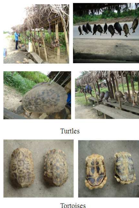
Fig 2. Turtles and tortoises displayed for sale along the East-West road, Central Niger Delta.