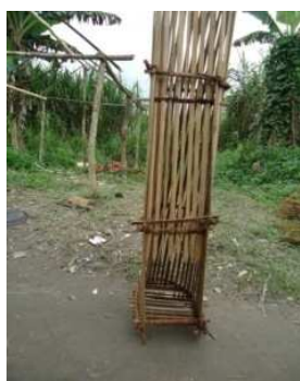
Fig 3. Sliding trap used to capture freshwater turtles and tortoises.