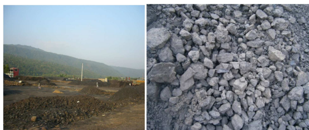
Fig. 1. Imported coal deposits in Tamabil, Sylhet, Bangladesh.