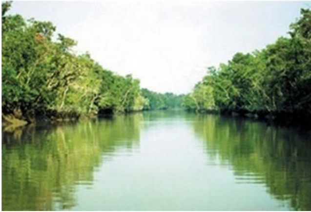
Figure 1. Water quality and mangrove forest tree before oil spillage into the Shela river of Sundarban.

Water samples were transported into the Centre for Sophisticated Instrumentation and Research Laboratory, Jessore University of Science and Technology, Jessore. University for analyzing different parameters.