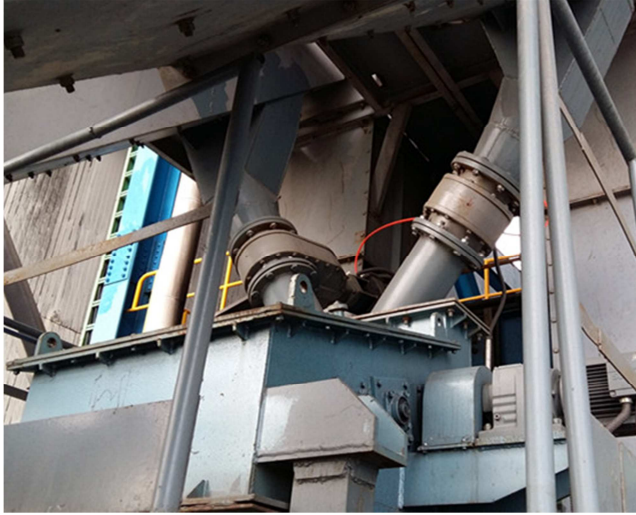
Figure 2. Ultra-fine roller screen located in the top of the slag bin.

is mastered by setting the level gauge. The operation of the bed material preparation and filling system and the material level signal of the bed material tank are connected to the control room. The bed material preparation, filling or stopping operation can be carried out at any time according to the operation of the boiler.