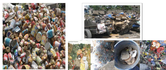
Figure 1. Commonly recycled solid waste types

the remaining 50% are buried, burned, or dumped by the road side or into drainage canals. However, the 10% recycled does not include animal dung that is sometimes used as fertilizers by horticulturalists, gardeners and food remains used to feed dogs and in piggery farms. When taken into account, these wastes may contribute another 10% of recycled waste. The materials that are usually known to be recycled are plastic and glass bottles, scrap metal, papers and aluminum cans as shown in Figure 1. So far, there has no recycling of ewaste though feasibility study shows that it is a profitable venture. Separation of recyclables suffers from a lack of knowledge regarding identification of materials, and appropriate techniques for handling, sorting, washing and grading.