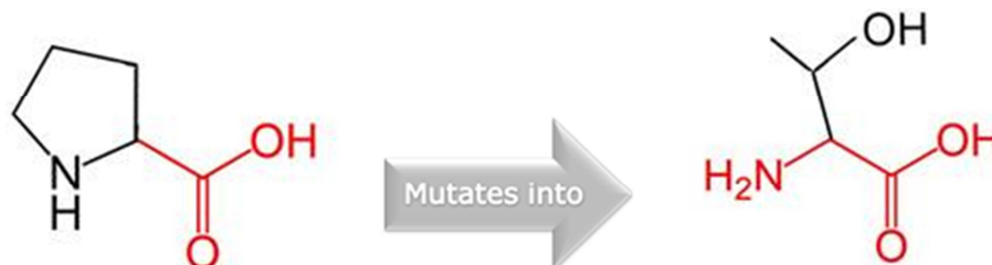
Figure 2. The schematic structures of the original (left) and the mutant (right) amino acid. The backbone, which is the same for each amino acid, is colored red. The side chain, unique for each amino acid, is colored black.

For the prediction of the mutation P275T(rs28928908), each amino acid has its own specific size, charge, and hydrophobicity-value. The original wild-type residue and newly introduced mutant residue often differ in these properties. The wild-type residue is more hydrophobic than the mutant residue. The results were shown in Figure 2.