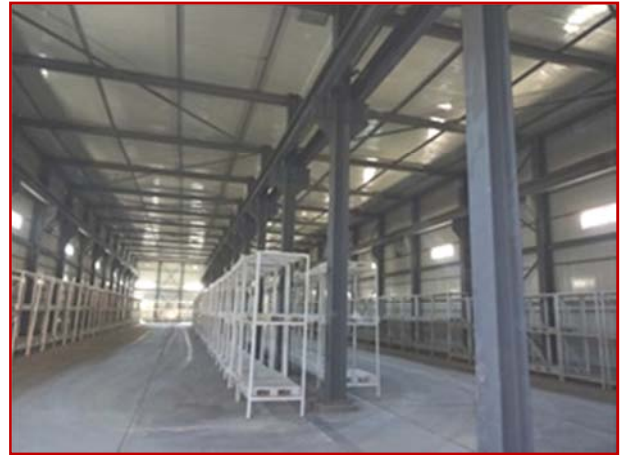
Figure 1. The storage facility at AL-Tuwaitha research nuclear site.