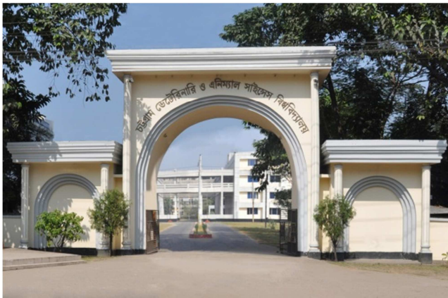
Figure 3. A part of Chattogram Veterinary and Animal Sciences University Campus.

There are three faculties; Faculty of Veterinary Medicine, Faculty of Fisheries and Faculty of Food Science and Technology at this university. Two Courses on English Language are offered to each faculty as Compulsory Course; Communicative English (Theory+Practical).