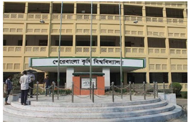
Figure 4. A part of She-re-Bangla Agricultural University Campus.

This university was established for the expansion of higher agricultural education and committed to promote research in various fields of agricultural sciences and to offer extension services.