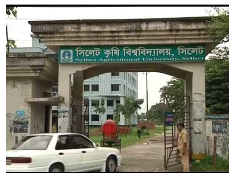
Figure 1. A part of Sylhet Agricultural University Campus.

perspectives in Bangladesh as well as abroad through excellence and innovation in teaching and learning, research and knowledge exchange. It is also contributing to the encroachment of society and the development of leaders through a global presence, regional significance and engagement with the rational activities to fill the demand of time.