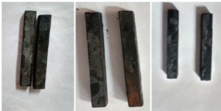
Figure 3. Inter critical annealed samples.