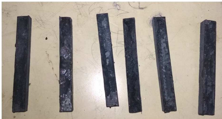
Figure 4. Annealed samples.