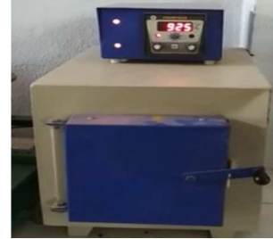
Figure 2. Muffle furnace used for annealing and ICA.

Seven specimens were carried out for annealing process using a muffle furnace at 925°C, 120 minutes soaking time. Annealed samples were cooled to normal room temperature in the furnace itself. Intercriticle annealing (ICA) conducted on 6 selected samples at individual temperatures of 750°C, 770°C and 790°C with a soaking time of 75, 77, 80 minutes respectively.