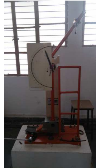
Figure 6. Impact test machine.

From table 5, the results were clearly showing that impact energy of the intercriticle samples were increased with increasing temperature. Impact energy for annealed sample is more as compared with the ICA samples this might due to high amount of ferrite phase in the metal matrix, but whereas for ICA samples depicting less impact energy due to the hard