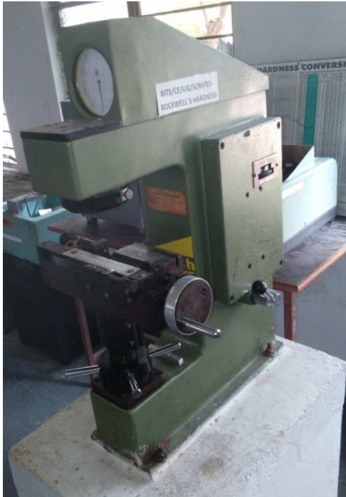
Figure 5. Rockwell hardness testing machine.