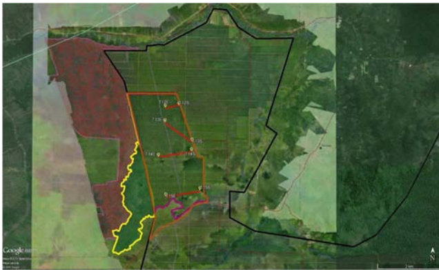
Figure 3. Orangutan habitat in North-west KAL. The area with the brown border is designated HCV. The overlapping area bordered in purple (600 ha) is the actual forest cover in and around this HCV. The area bordered in yellow is contiguous forest cover outside the concession. The yellow and purple areas combined, measure 820 ha in area.

time, the north-western HCV block still extended outside the company boundaries into community forest, but fires and land clearing by communities in 2015 destroyed large areas of these community forests, as well as parts of the HCV itself. Based on maps provided and pre-fire satellite imagery from Google Earth, the north-western HCV block covers approximately 664 ha and at most 600 ha is still forested after the fires (Figure 3) a loss of 64 ha of forest. We estimate that this total forest block (in and outside the concession) was about 1,600 ha prior to recent land clearing and fires and that currently at least 57 ( \pm 15 ) orangutans are compressed into the remaining 820 ha, including 42 ( \pm 11 ) crowded into the 600 ha of forest inside the concession (see Figure 3).