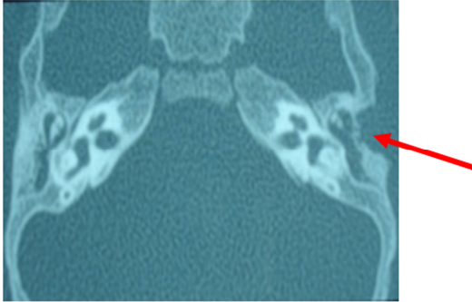
Figure 1. CT scan of temporal bones (axial view): filling of the left middle ear, lysis of the scale of the temporal, thickening of soft left temporal parts.

Temporal MRI showed bilateral inflammatory filling of the middle ear complicated with a collection of left external soft temporal parts (Figure 2).