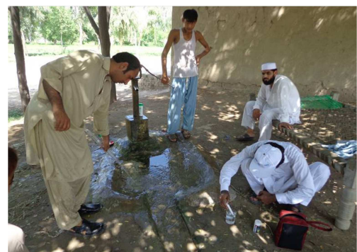
Figure 4. Communal Hand pump.