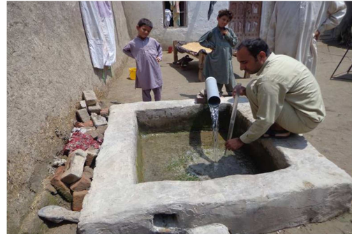
Figure 1. Water pump in open area.

laboratory by using DelAgua testing kit and Quantofix arsenic kits. As per field findings, the following water sources exist in the area of intervention; Motorized borehole, PHED Schemes, Open well, shallow hand pumps and borehole with Natural water flow