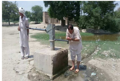
Figure 2. Water hand pump by community.