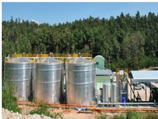
Figure 5. Biogas plant, Mae Taeng, Chiang Mai Province, Thailand [28].

The standard biogas plant was illustrated in Figure 5. Anaerobic digestion is an optimal way to treat organic waste matter, resulting in biogas and residue. Utilization of the residue as a crop fertilizer should enhance crop yield and soil fertility, promoting closure of the global energy and nutrient cycles [24]. The digestate byproduct is the result of a mineralization process which, in general, can be used as fertilizer since it is rich in nutrients (high nitrogen-to-carbon ratio), enhances nutrient-penetration into the soil and reduces up to 80% of odours from the feedstock [25, 26]. This high content is advantageous to the organic agricultural crops as they are primarily capable of utilizing ammonium nitrogen. The slurry from the digester is rich in ammonium and other nutrients used as an organic fertilizer [24]. It is often possible to replace nitrogen from commercial fertilizer by digested slurry and thus save money [27].