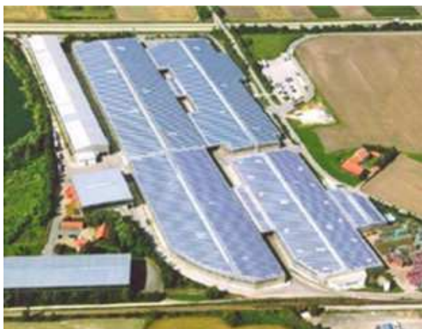
Figure 1. Solar system based on Si-single crystals [12].