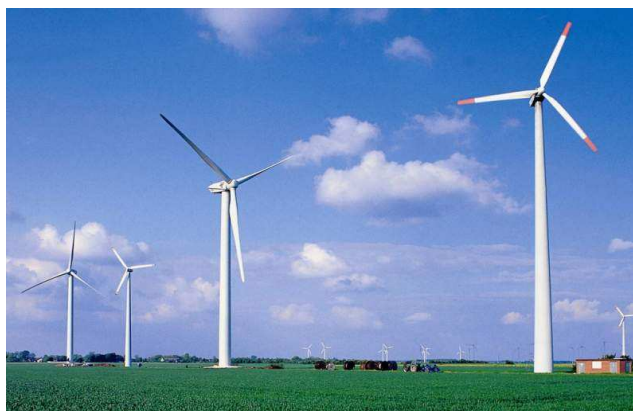
Figure 2. The typical wind turbines.

increase the economic efficiency of wind energy, organic agricultural producers are likely to increase their use of wind power to lower energy costs and become more energy self-sufficient.