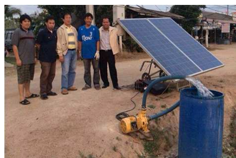
Figure 4. Solar water pump system, Chiang Mai Province, Thailand.

To meet the energy demands and reduce the environmental impact, the idea of integrating RESs such as solar photovoltaic, solar thermal, wind, biomass and hybrid forms of energy with water pumps has been proposed by many researchers around the world [19]. Comparing with conventional fuel, solar water pumping system has numerous advantages, for instance, besides of no cost for fuel and maintenance, the system it has no noise and pollution for the environment [20, 21]. Although there are solar water pumps with high capacity (10 of kW can be used), usually the pumps that are used in remote areas are small scale one (usually less than 1500 W). The main issue regarding to these systems is maintenance while at the same time 24 h electrical service is not demanded [7, 22]. Solar water pump system is generally divided into two groups; solar photovoltaic and solar thermal water pumping systems. The research developments with renewable energy source water pumping systems are presented in this section. Renewable energy source water pumping systems are classified into five major groups as follows: (1) solar photovoltaic water pumping systems, (2) solar thermal water pumping systems, (3) wind energy water pumping systems, (4) biomass water pumping systems and (5) hybrid renewable energy water pumping systems. The typical solar water pump system was demonstrated in the Figure 4.