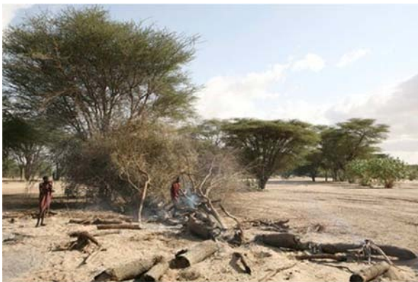
Figure 2. Fuel requirement as a reason for deforestation.