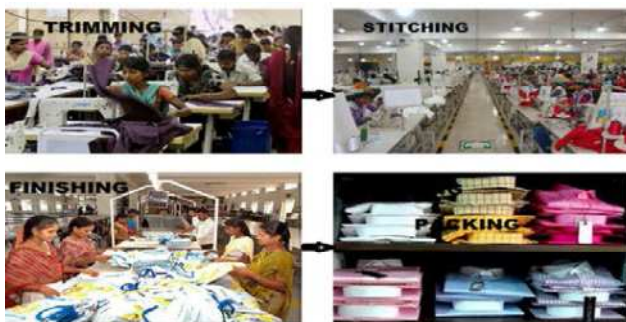
Figure 3. Modular Garments Production System. [14].

It seems that MPS is the perfect solution for the apparel manufacturer to respond to the quick replenishment requirement by the retailers. [17]. Although MPS can provide obvious benefits for the apparel manufactures, the diffusion of MPS in the apparel industry is slow. The possible reasons for this phenomenon are studied by the researchers, most from the perspective of human resource practices [18, 19].