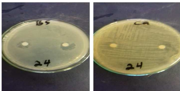
Figure 4. Antimicrobial activity of Belpharis linariifolia of seeds oil. Zone of inhibition of oil against standard bacteria and fungi.