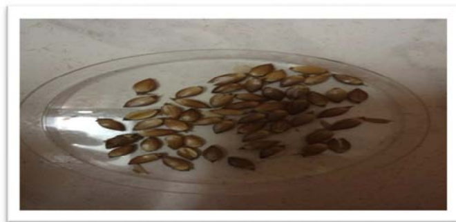
Figure 1. Belpharis linariifolia (Seeds).

Belpharis linariifolia seeds were collected from alpine north Kordfan and identified and ethnocatated by plant taxonomist at ministry of agriculture in Khartoum, Sudan. Seeds were air-dried, under the shade, pulverized and stored prior to extraction. Shade with good ventilation and then ground finely in a mill and kept in the herbarium until oil extract preparation Figure (1).