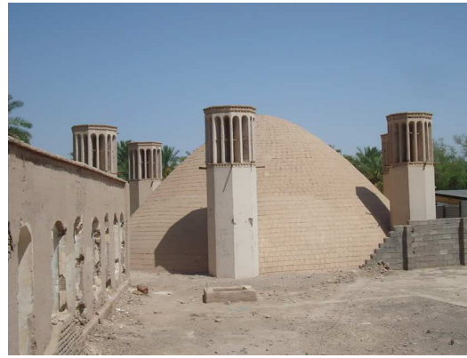
Figure 3. Windcatchers of cistern in Shahdad

In accordance to local wind direction, windcatcher to be designed, choosing windcatcher one, two or by multi direction should be on the basis of the amount and the wind direction for the months which the building needs cooling. In buildings with different usages like residential or reservoir, it could be seen that wind speed will be increased by becoming greater the height so this wind speed in the roof is greater than below stores and it could be possible for using of smaller openings toward the ground windows because on the roof, the wind has lesser obstacles, windcatcher can absorb the wind in every direction.