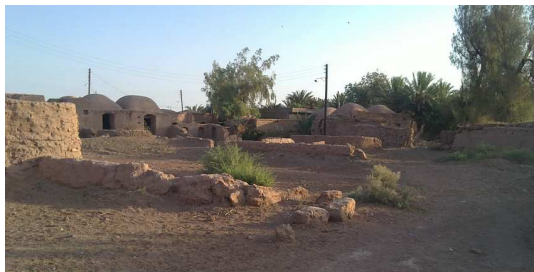
Figure 1. Architecture of southern Suburbs of the Lut desert.

using the material with high hot capacity- using of compressed plan designing- applying of dome roof- indirectly connection the building onto ground. Using the door and windows in few number and small surface- usage ventilation equipment and lesser natural ventilation- compressed city texture and using light colors for external part of the building.