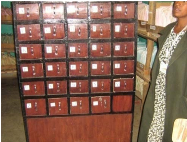
Figure 8. Health center MPI box July 2011.