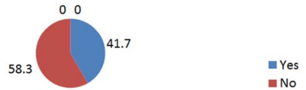
Figure 5. Percentage of HMIS utilization in health centers July 2011.

About a quarter of the respondents 111(27.2%) reported that they use generated information's for all intended purposes including; to give information to the user, to compare it with the previous, for Monitoring/Evaluation of programs to take immediate action and for planning purposes and 46(11.2%) of the respondents forward the generated information to upper level. (Table-3)