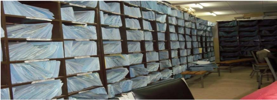
Figure 6. Standard MRU with & sufficient aeration and moving spaces A. A health center 2011.

Some of health centers had small and staffed with materials with little aeration and open spaces. Even if some of them had standard card room size had only one and two windows for the fast tracking system purpose and they had staffed and suffocated card rooms (Fig 7).