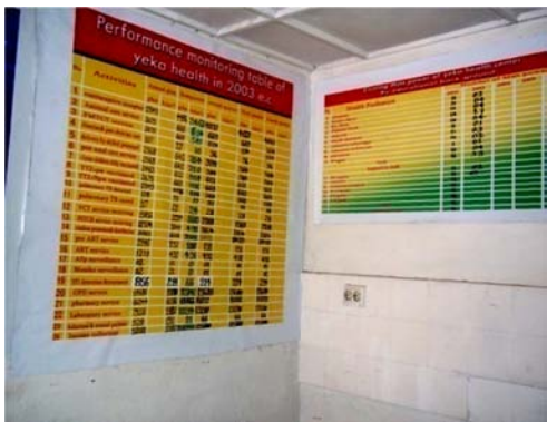
Figure 3. One of the Health Center use displayed information at, A. A. July 2011.

The data collected and documented using paper formats and sometimes it may be directly feed into the computer formats. In the studied health facilities, 178(43.6%) were used only paper formats to generate client health information and 164(40.2%) of the health centers used both computer formats and paper formats in combination while 66(16.2%) of them used only computer formats to collect and document the health information of their client (figure 4)