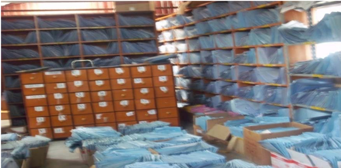
Figure 7. Medical record units with small size and staffed by materials with little aeration and open space, July 2011.

Some of health centers had small and staffed with materials with little aeration and open spaces. Even if some of them had standard card room size had only one and two windows for the fast tracking system purpose and they had staffed and suffocated card rooms (Fig 7).