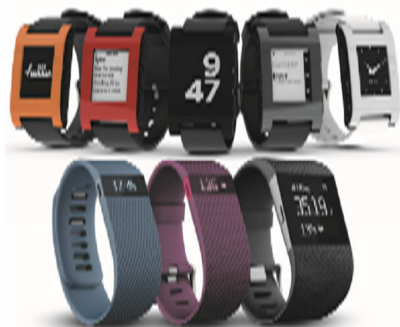
Figure 2. Smart watches and fitness trackers.

IoT applications have found tremendous use in the enterprise/industry for enhancement of production, cost reduction and safety. Although domestic usage has also been on the rise as personal IoT devices and applications have flooded the market. The Smartphone revolution is a typical