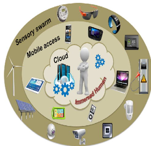
Figure 3. Internet of Things; Applications, Sensors, Storage and Human Immersion (Source: [25]).

The basic features of Internet of Things are Artificial Intelligence, Connectivity, Sensors, active engagement, and usage of small devices and explained below: