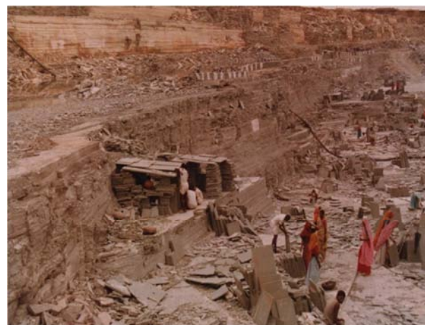
Figure 3. Uncleaned Floor in Manual Mining.

The Kotah stone slabs/tiles so produced we're carried out of pit as headload to load the truck for transporting to surface. All the above production activities we're done manually exposing high accidental risk to persons working. Minor to serious injuries to fingers, hand, leg, foot, eyes and even forehead were on record. Fracture injuries and even fatal injuries were on record. Due to large production waste lying on working floor many injuries/ even fatal accidents due to slipping and knocking down while carrying head load we're common cause of accidents. Many accidents had taken during transfer of product as headload outside the pit due to accidental breakage of slab or slipping/ knocking down due to uncleaned floor.