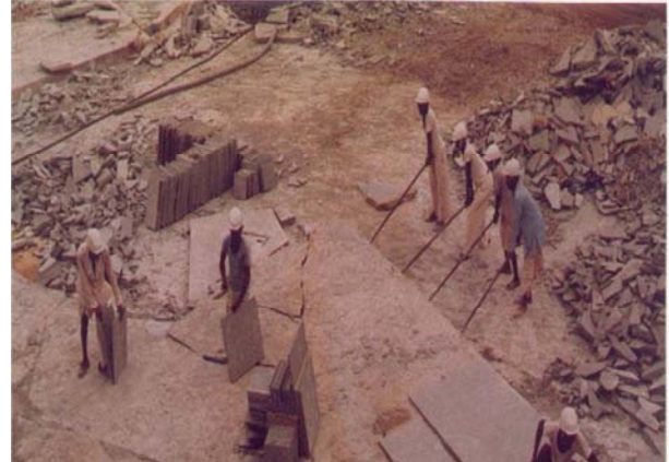
Figure 2. Manual Quarring of Kotah Stone.

Splitting the non -dimensional chunk of Kotah Stone using chiesel and hammer along natural cleavage planes to yield thin splits,