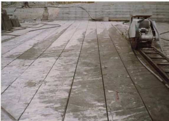
Figure 5. Jhiri Machine Cutting Kotah Stone Layers at 2 ft interval.

For cutting the layers of Kotah Stone in- situ portable electrically operated machine fitted with 36" dia steel blades were designed and perfected. The steel blades are tipped with diamond impregnated segments 64 in numbers. These machines locally known as Jhiri m/c are operated on 2' wide portable track.