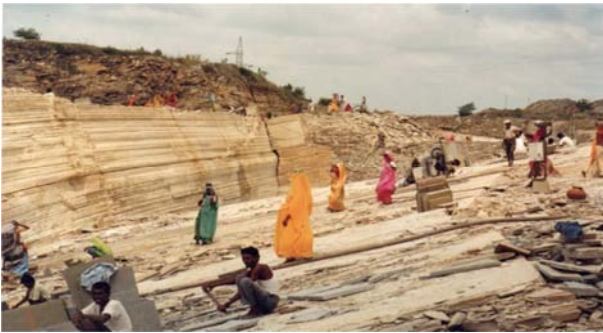
Figure 8. Manual Mining with High Bench Heights.

In an opencast mines stability of bench slope plays a crucial role in avoiding danger either from failures or any loose stone rolling down and hitting either man or machines. In manually worked mines bench height varied from 2 m to as high as 15m sloping dangerously at 80-85° from horizontal. Deposit being very comparative there has not been any incidence of slope failure but definitely it had exposed risk of stone rolling down at hitting the workers.