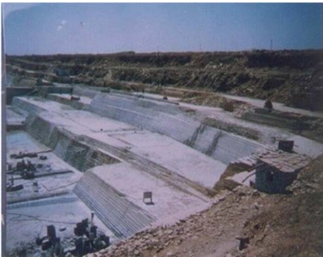
Figure 9. Long View of Query being worked with Innovative Technology.

With innovative technology benches with nicely cut steps 6" wide, 12" fall have been cut by machine sopping at safe angle of 55-60 degree from horizontal.