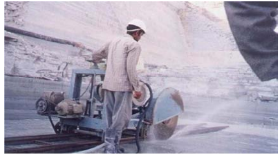
Figure 7. Cooling Water Ejecting out in form of Mist.

Hygrometer Survey was conducted by author about working comfort prevailing in the quarry both manually worked and worked with innovated technology during month of May, the peak summer month. The comparative results are tabulated below.