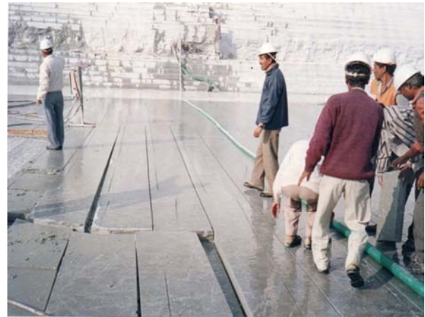
Figure 6. Working of Thickest Layer of Kotah Stone.

In this system there is hardly any breakage except when there is a natural crack. Physical human efforts has substantially reduced leading to increase in productivity to 2.5 times. Density of employment reduced from 1 to 0.4 per square 100 sqft floor area providing more walking space. Earlier with manual mining layers only -3" thick were mined and rest were thrown as waste. But with mechanised mining all solid layers irrespective of thickness are being mined successfully. This has improved mineral conservation appreciably.