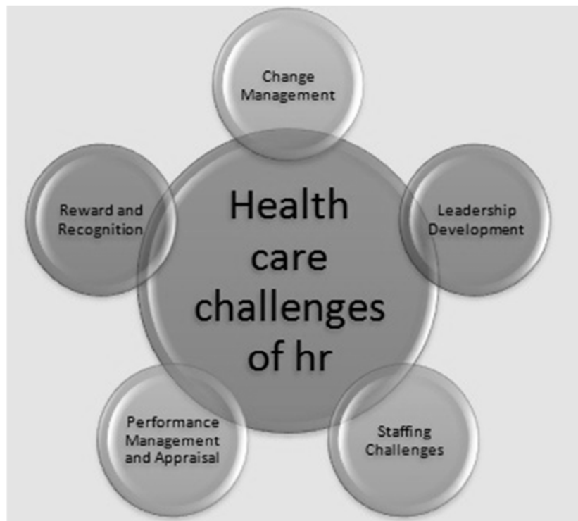
Figure 1. Healthcare Challenges of HR.