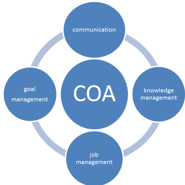
Figure 2. COA management system model.

Collaborative action management system revolves around communication, knowledge management, goal management, job management. Team members have high communication efficiency, members can exchange their work experience and form knowledge reserve, and have definite working goal.