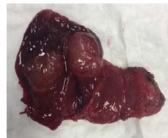
Figure 3. Right thyroid lobe with 3.5 cm (T2) papillary thyroid carcinoma.

Follow up of the patients was carried out in the outpatient clinic 2 weeks post-operatively. Then, they were clinically examined every 3 months. Neck US, serum T3, T4, TSH, & Tg levels were done every 6 months. Any suspicious local neck recurrence was confirmed cytologically by US guided FNAC, while any distant metastasis was assessed by RAI uptake scanning and CT scan.