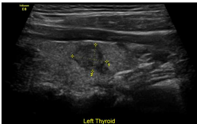
Figure 1. Neck US showing left thyroid lobe with 2x1.5 cm (T1) papillary thyroid carcinoma.

After confirming that the patient had PTC of stage I or stage II with no clinical or radiological evidence of cervical lymph nodes involvement, an informed consent for total thyroidectomy was taken from all the cases.