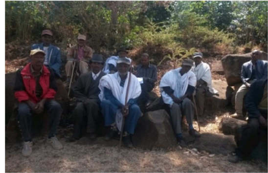
Figure 2. FGD at Kolba Anchabi Kebele.

sense for agricultural and rural development. The focused groups at each study area described important constraints to maize production. The groups also identified and listed the major constraints recognized and agreed on by most participants in the sampled kebeles. The constraints were seed & high cost of inorganic fertilizers, weak extension services, Wild and domestic animals, weevils, rodents, low maize price and instability of maize price were among the constraints.