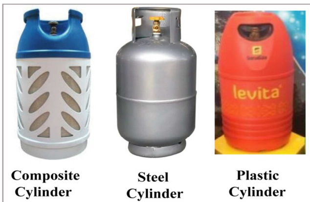
Figure 2. Variety of LPG Cylinders [1].

The work was conducted on the LPG cylinder filling process and the safety during filling time. LP gas filled in different sizes of cylinders. Step by step of this process has been explained in this paper. Probable hazard and required safety during the work are also explained in this paper. Most of the LPG cylinders are made of steel. Plastic and aluminum are becoming popular alternatives to steel where weight is an issue. Composite type LPG cylinders are also interesting alternative to steel. The capacity of LPG Cylinders range from under 1kg to 50kg of LPG [1, 4, 7].