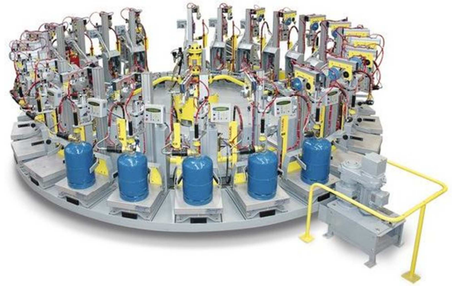
Figure 3. Cylinder Filling Carousel [20].

industry has an alternative way to fill cylinder manually [19, 20].