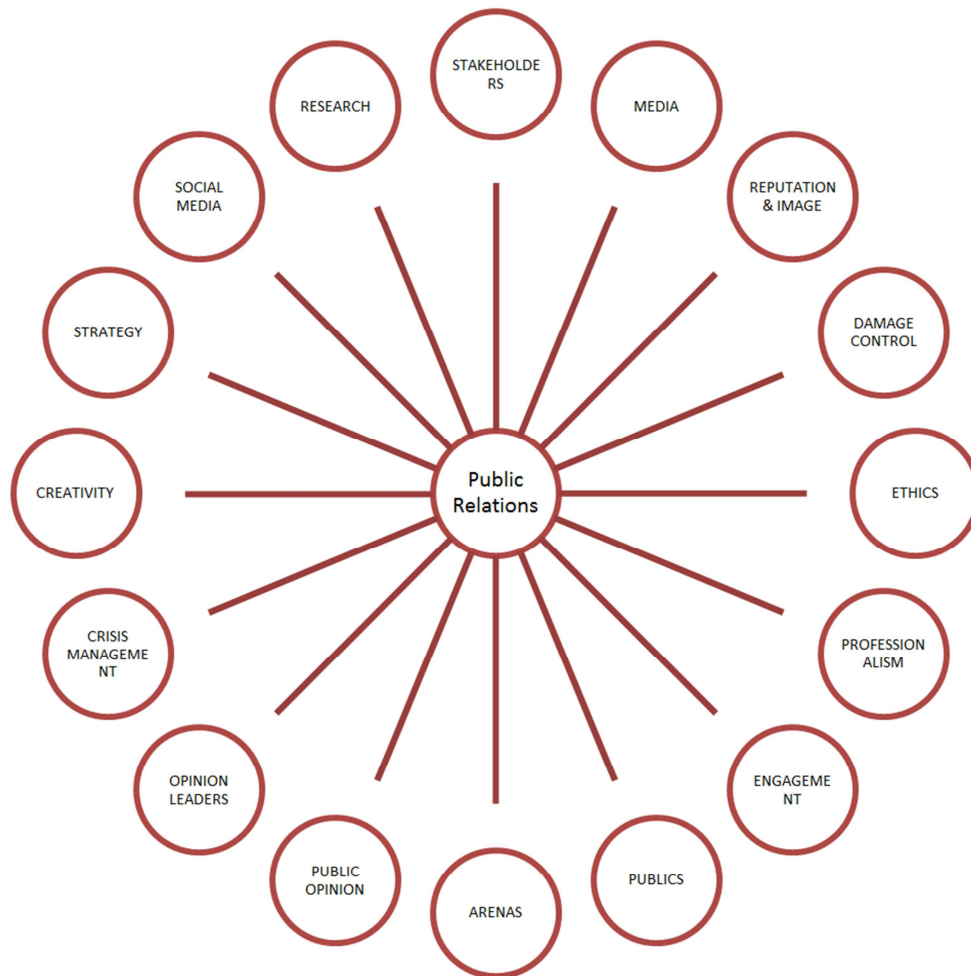
Figure 2. Conceptualization of Public Relations Issues.

We were fascinated by how giant MNCs handle major crises affecting their reputation and image, and the amount of compensation they have to pay as well as the Corporate Social Responsibility they do to redeem their image. This is an area for further research [10, 11, 13, 22, 24, 27]