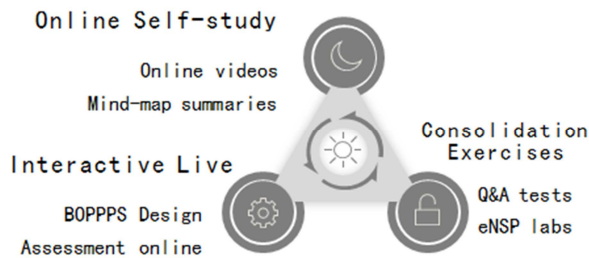
Figure 3. There are three figures illustrated here.

complete the study of the relevant content through the pre-class test in the online interactive live classroom. Classroom instructional design can design and organize students for participatory learning.