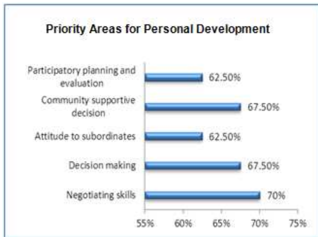
Graph 4. Additional training needs for Personal Development.

70% of the respondent pointed out training needs in the negotiating skills and 67.5 % participants need training in decision making skills and community supportive decisions.