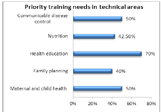
Graph 2. Additional training needs in the technical areas.

Priority training needs identified by RH/FP leaders: