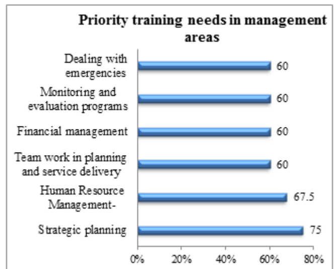
Graph 3. Additional training needs in the management areas.

It is noteworthy that 70% of the individuals identify training need in the area of Health Education followed by maternal and child health and communicable disease control knowledge