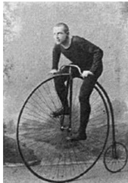
Figure 1. High front wheel bicycle.

In the western countries, there is a long history of cycling, and the riding suit is accompanied by the rise, development, change and improvement of the bicycle. As early as in 1791, the world's first "bicycle" was born, since people like to ride, so