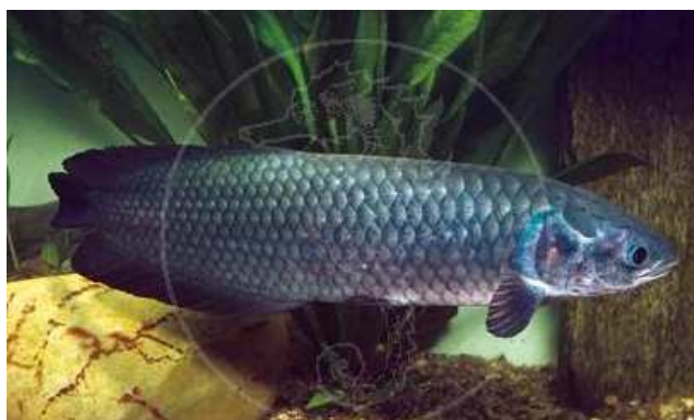
Figure 1. Image of a typical African arowana ( Heterotis niloticus ).

Proximate components of the Heterotis niloticus samples were determined using the methods of Association of Official Analytical Chemists [10]. The components were moisture, ash, fat, and protein; carbohydrate was determined by difference.