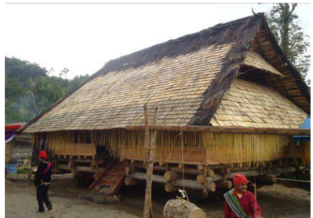
Figure 1. Architecture Lobo [5]

Lobo made open architecture, \pm 80 cm high walls, made without the room, the floor consists of 3 levels: the first level, is a rectangular room, the middle section is a pole king called ' Padence ' is made of a circular beam where the heads results headhunting hanged man and to be adored with the traditional ceremony (now replaced with a buffalo head). This room is for common people, performing ritual dances and songs of worship, as well as take care of the need to eat and drink. The second floor as high as \pm 60 cm of space made padence halls or also called ' Asari ' located along or around the walls of the building, \pm 150 cm wide on the right or left side of the room, reserved for the nobility, village authorities and stakeholders custom called ' Palangka I '. The third floor on the other side either side of the I Palangka high as \pm 40 cm above the padence called ' Palangka II ' is a special space reserved for distinguished guests from outside the village. On the front there Palangka ' Rapu ' (kitchen) one or two pieces and made a seat on Rapu.